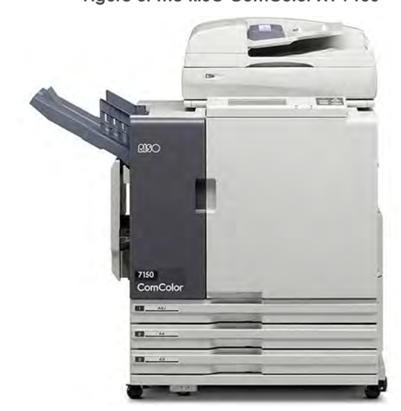
Figure 3: The RISO ComColor X1 7150

The RISO ComColor X1 7150 is a full-color sheet-fed inkjet printer featuring print speeds of up to 120 ppm at 600x600 dpi and a maximum duty cycle of 500,000 impressions per month. The printer provides high-speed production at a very low cost using newly-developed ink technology that reduces ink transparency and improves black ink density. The ComColor reduces power consumption with an automatic power shut-off, is ENERYG STAR® Certified, and does not require a dedicated 220V power circuit to run. It can operate on a standard 110V outlet and is small enough to fit just about anywhere.