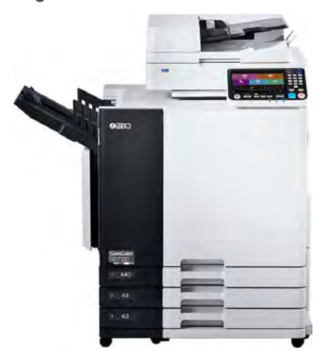
Figure 4: RISO's ComColor GD 7330

The RISO ComColor GD 7330 is a full-color sheet-fed inkjet device featuring print speeds of up to 130 ppm at 600x600 dpi and a maximum duty cycle of 500,000 impressions per month. The printer is engineered for high-production environments, providing high-speed color printing at a very low cost using newly-developed ink technology that reduces transparency and improves black ink density. It also leverages a fifth color (gray ink) to provide denser blacks and improved color reproduction and stability. Mr. Gerlach of Somerville High School states, "Our customers love the color quality that the fifth gray unit provides; it gives our projects an extra pop of color."