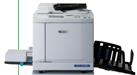
RISO Digital Duplicator

RISO Rice Bran Oil Ink is for RISO SF Series. (RISO INK F Type)